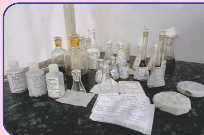
DIFFERENT FORMULATIONS PREPARED IN PHARMACEUTICS LABORATORY