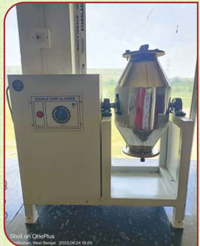
DOUBLE CONE BLENDER