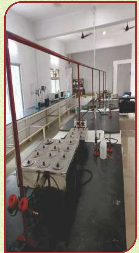
PHARMA CHEMISTRY LAB.