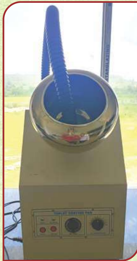
TABLET COATING PAN