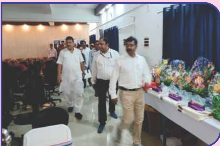
INAUGURATION OF SEMINAR HALL