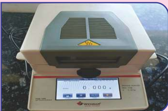
DIGITAL MOISTURE ANALYZER